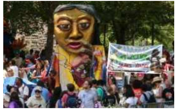
Rally at United States Social Forum in Detroit